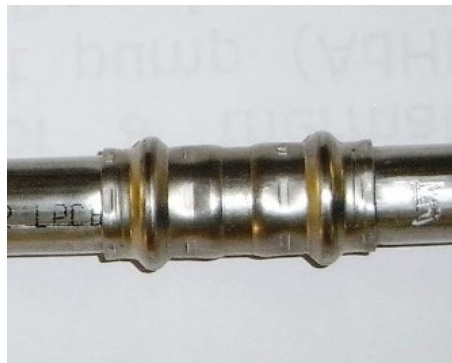
Fig.2 Pressed Fitting