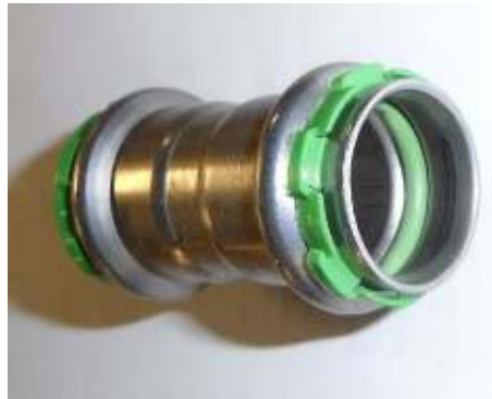
Fig. 1 Fitting before installation (Viton)