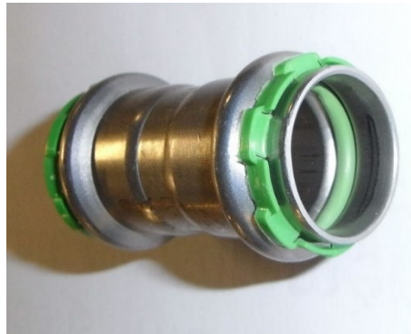
Fig. 1 Fitting before installation (Viton)